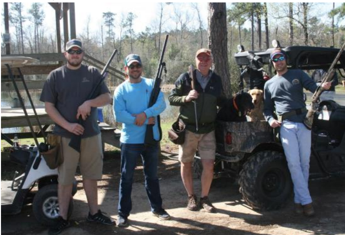
Division II First Place – YMBL