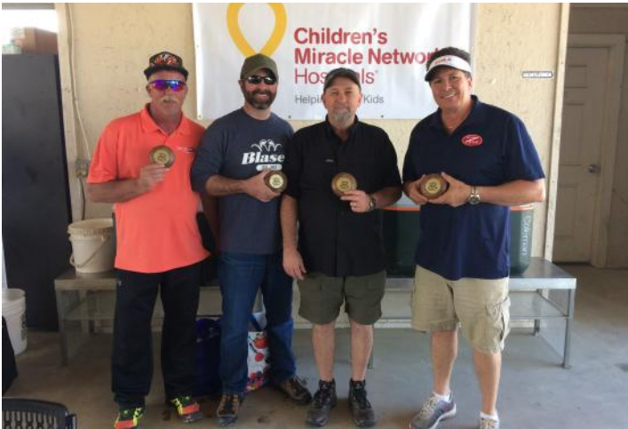
Division I Highest Overall Team – P-3 Petroleum

Congratulations to our winners and thank you to everyone who participated! With your help, we raised over $30,000 for Children's Miracle Network Hospitals and the CHRISTUS Southeast Texas Foundation.