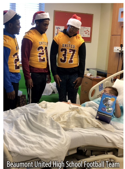
Beaumont United High School Football Team