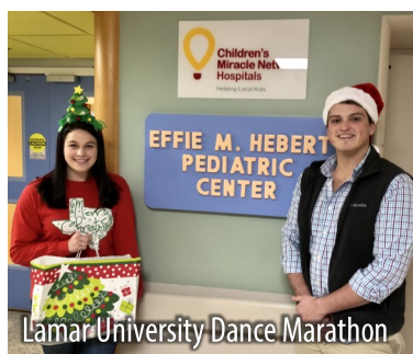
Lamar University Dance Marathon