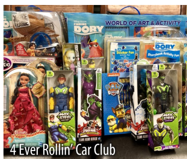
4 Ever Rollin' Car Club