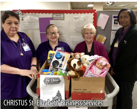
CHRISTUS St. Elizabeth Business Services