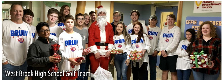
West Brook High School Golf Team