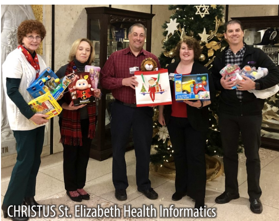
CHRISTUS St. Elizabeth Health Informatics