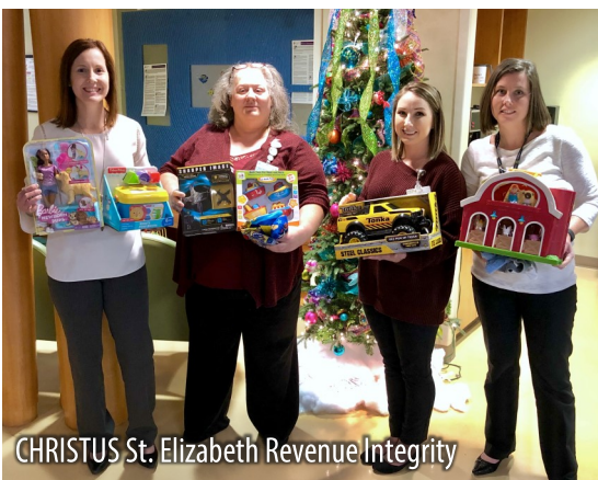
CHRISTUS St. Elizabeth Revenue Integrity

Donations made to Children's Miracle Network Hospitals through the Toy Drive of Southeast Texas will provide entertainment for pediatric patients at CHRISTUS Southeast Texas St. Elizabeth throughout the year.